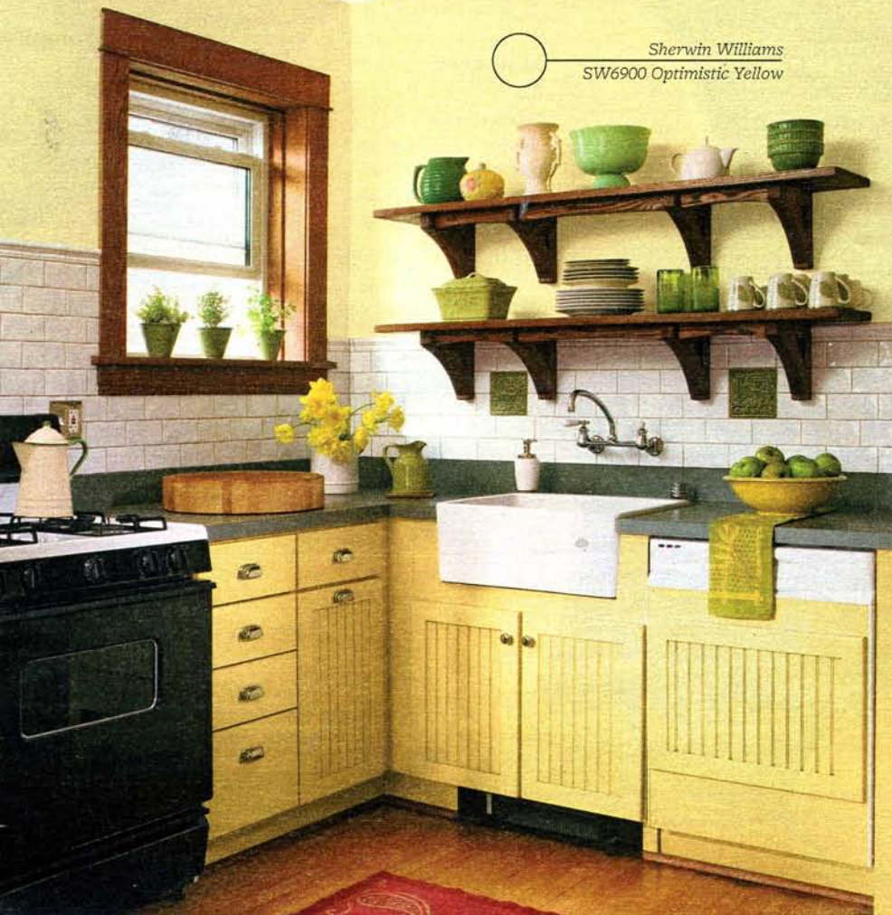
Sherwin Williams SW6900 Optimistic Yellow